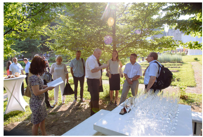
Learning about culture of drinking wine

"EU – an obstacle or a common opportunity "