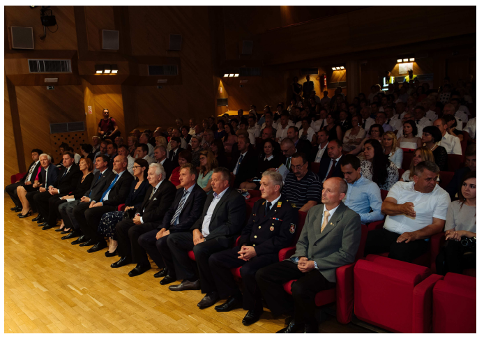
Gathering tougetherwith friends is great 🙂