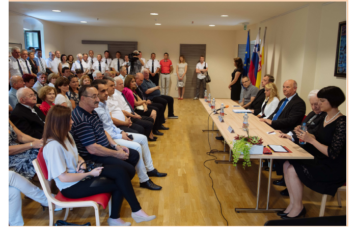
At the presentation of Monografy »870-years of first written mention of Konjice«

During the project, our present cooperation and integration participating municipalities was upgraded with a three-day long educational seminar in Slovenske Konjice at the beginning of July 2016. The main focus was on discovering advantages of EU or disappointments about its results. Our project pursues the objectives of the Lisbon Strategy, contributes to the achievements of the European Agenda for Culture and its Work Plan for Culture and Sport. The discussion during the project contributed to convincing Eurosceptics about the benefits of EU membership.